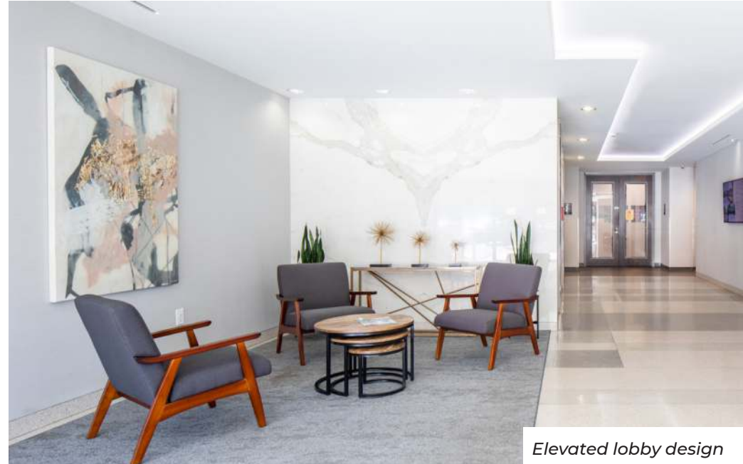
Elevated lobby design

With access to Smyrna's choice neighborhoods and top Cobb County schools